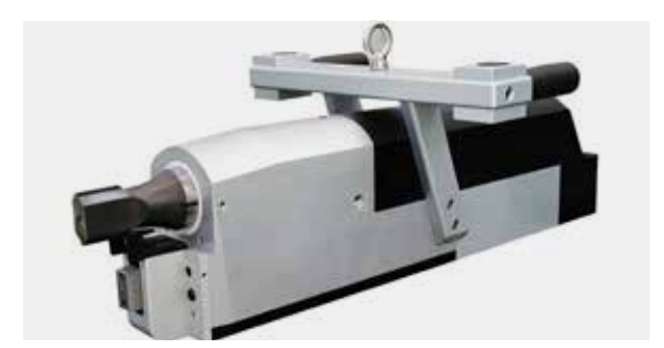
Ultrasonic welding systems