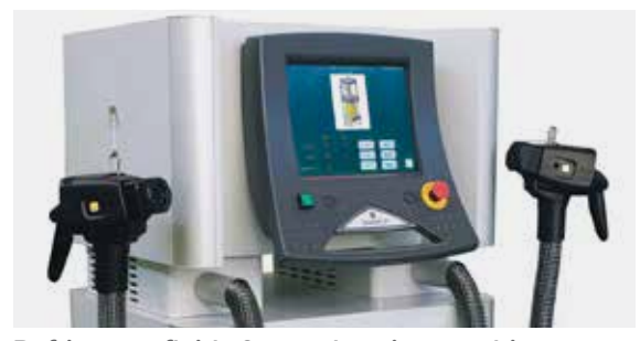
Refrigerant fluids & gas charging machines