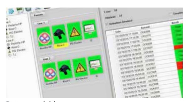
Data acquisition systems