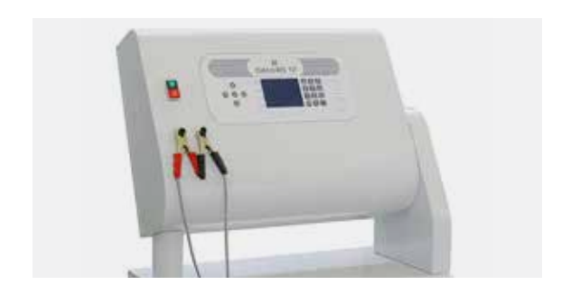
Electrical safety test