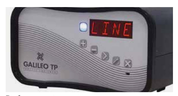
Performance test system