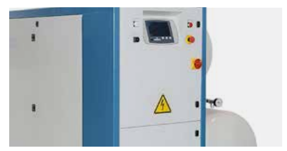
Helium recovery systems